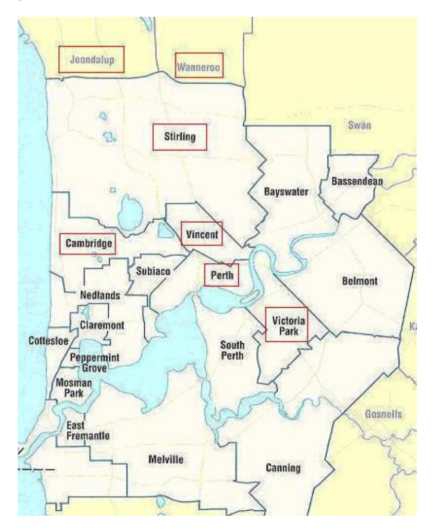
Note: The Shires of Chittering and Gingin adjoin Wanneroo.

Returns should mirror most of the information contained in the primary or annual returns prepared by Council members for the local governments they represent except that with respect to real property, the return must include any property within the TPRC regional area or in a local government adjacent to any of the TPRC participant Councils. To assist members, the plan below shows the TPRC local governments and adjoining local governments.